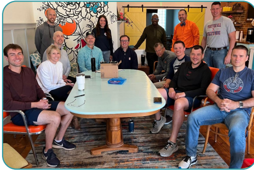
Mahomet Coaches Huddle

Currently, there are coaches huddles in Fisher, Mahomet, Monticello, Tolono, Tuscola, Champaign, Urbana, Rantoul, Parkland, and the U of I. Week by week, coaches gather to study God's Word and discuss how to apply the Scriptures to coaching and life more broadly. In the various coaches huddles, we've studied 1 Samuel, several Psalms, the Sermon on the Mount, Mark, Philippians, 1 Thessalonians, James, and 1 John — as well as utilizing discipleship material like "360 Coach" and "The Core."